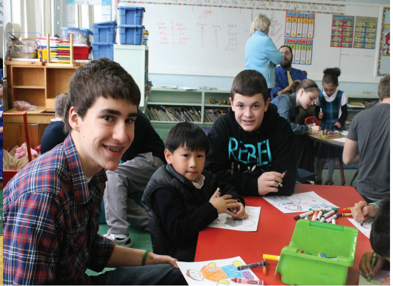
Layout by Kate Harvey